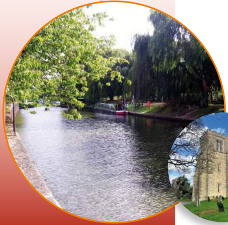
Saxilby Riverside & St Botolph's Church