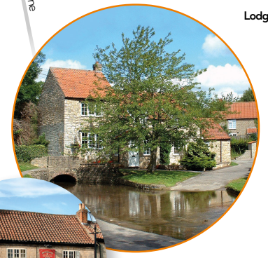
Nettleham Ford & The Plough Inn